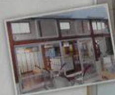
Valuables should be placed in a locker. Then you take the key to the locker into the bath with you.