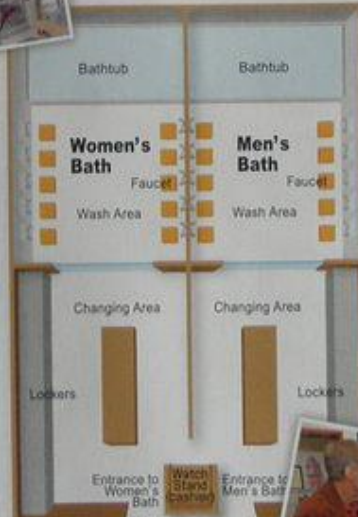
You pay to enter at the Watch Stand by the entrance.